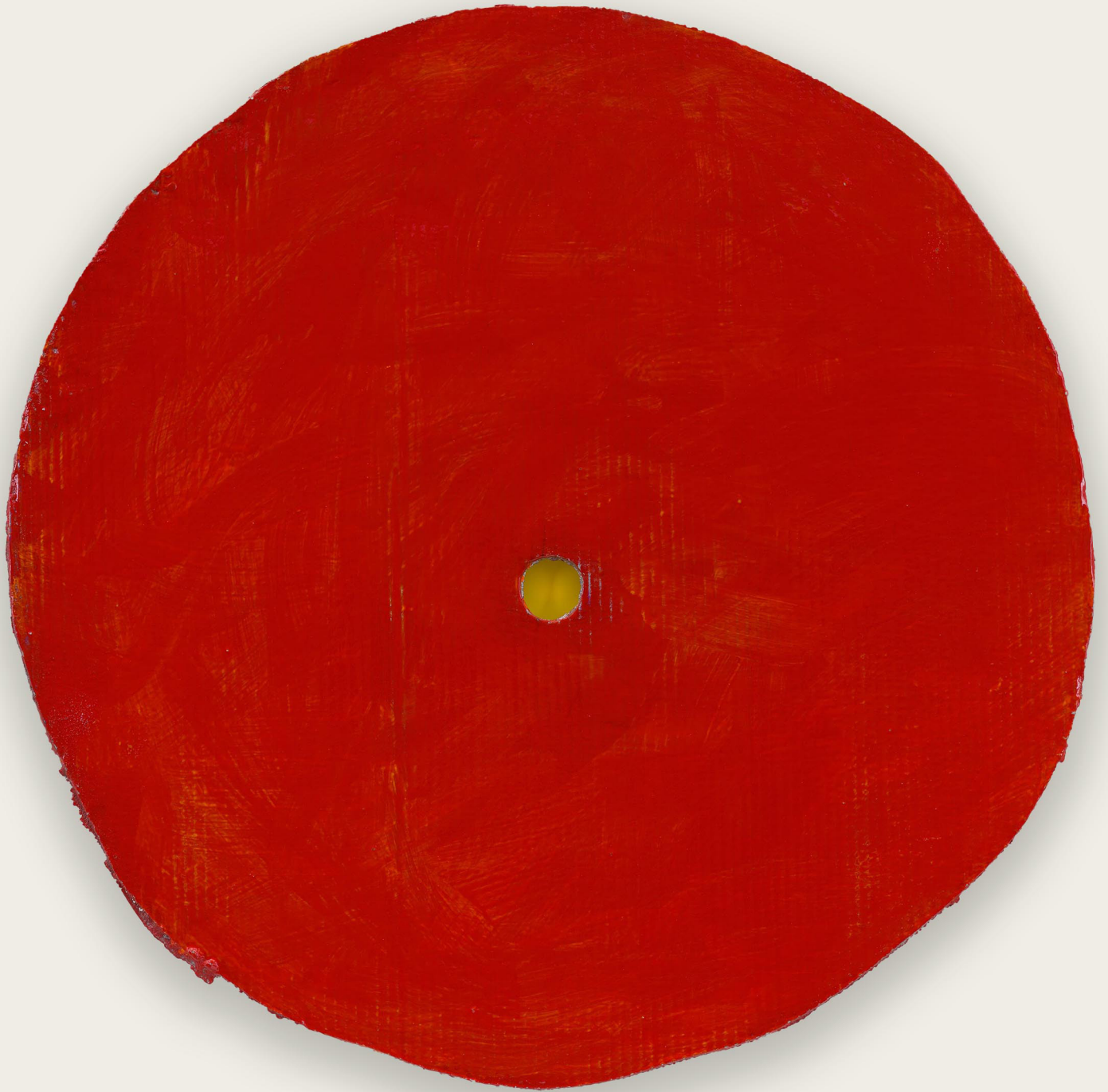
Jonathan McCree Red Circle, Yellow Square , 2023 80 x 80 cm Aluminium