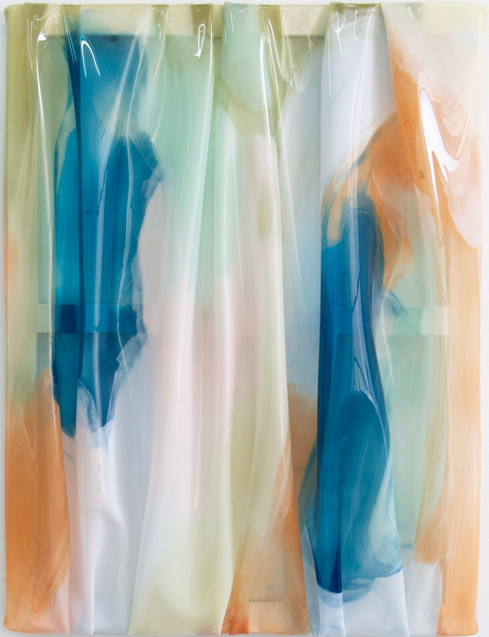
Manon Steyaert Beautiful and Strange , 2024 60 x 80 x 5 cm Silicone and Pigment