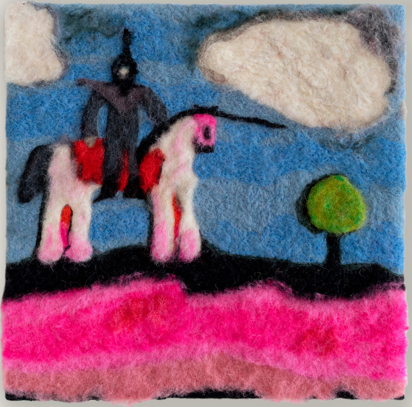
Sebastian Supanz You and I , 2023 40 x 40 cm Wool on Canvas